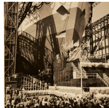
Launching of the tanker Tina Onassis, 25 July 1953.