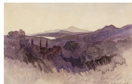
Edward Lear 1864, Psiloritis (Mount Ida) from Phre, before sunrise, 4.30 a.m.