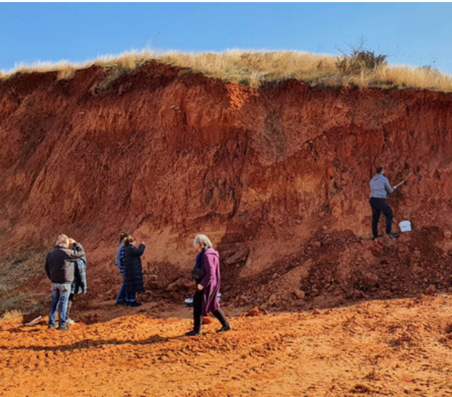
A large clay outcrop in the area of Thessaloniki, Greece