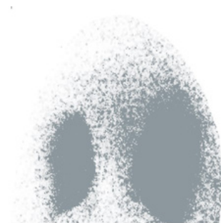
Beckett's Breath cover image