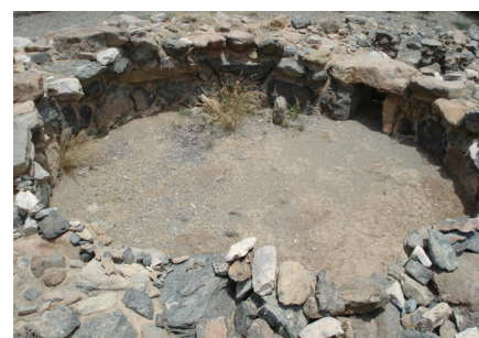
Lebena Gerokampos Tholos Tomb II

Tuesday 21 May 2024 17:00 (UK) / 19:00 (Greece)