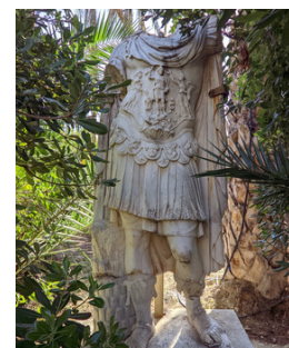
Roman Imperial statue at Knossos

Tuesday 4 June 2024 17:00 (UK) / 19:00 (Greece)