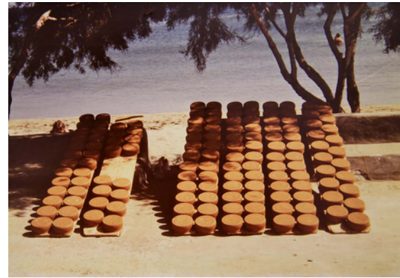
Cookware drying in Platys Gialos, c. 1980.

Apostolidis Pottery.